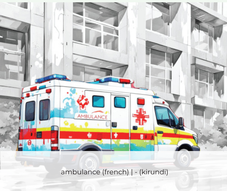
ambulance (french) | - (kirundi)

When travelling, as a non-native speaker of a language or when you cannot speak, quickly communicating how you think and feel to a medical professional can be life-saving. Visit https://care.gayther.com/medical-diagnosis/ for more information.