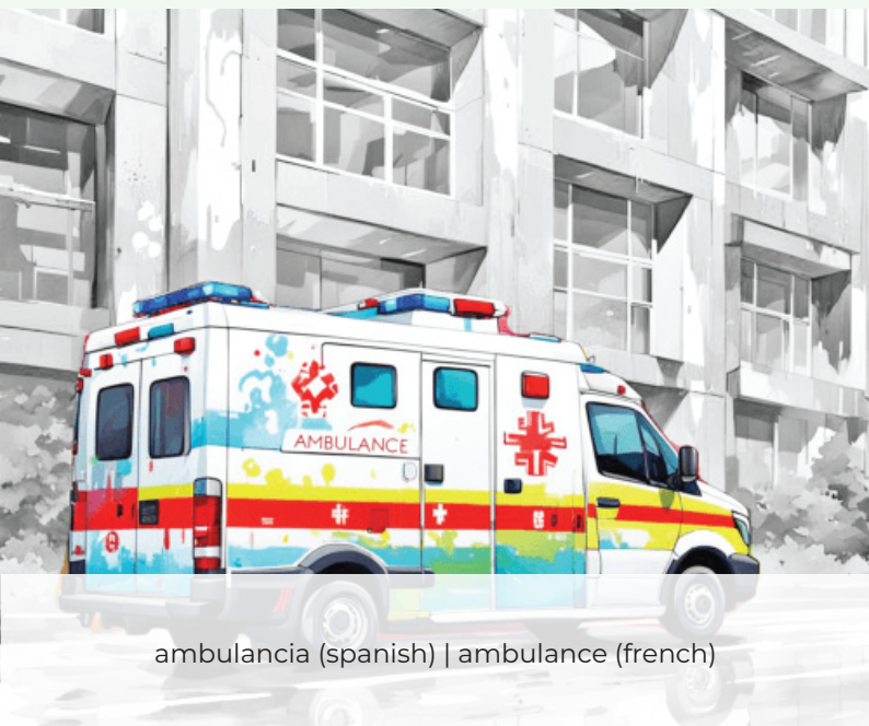
ambulancia (spanish) | ambulance (french)

When travelling, as a non-native speaker of a language or when you cannot speak, quickly communicating how you think and feel to a medical professional can be life-saving. Visit https://care.gayther.com/medical-diagnosis/ for more information.